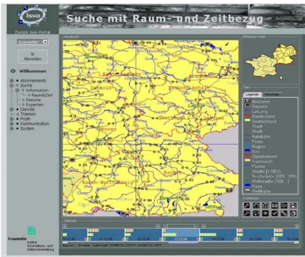
Fig 3: Screenshot of main GSSW user interface